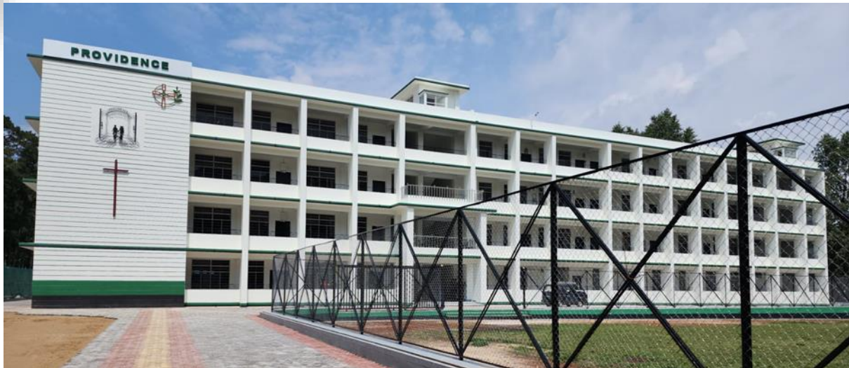
A view of the New bulding

OUR GREATEST STRENGTH LIES IN THE GENTLENESS AND TENDERNESS OF OUR HEART. RUMI