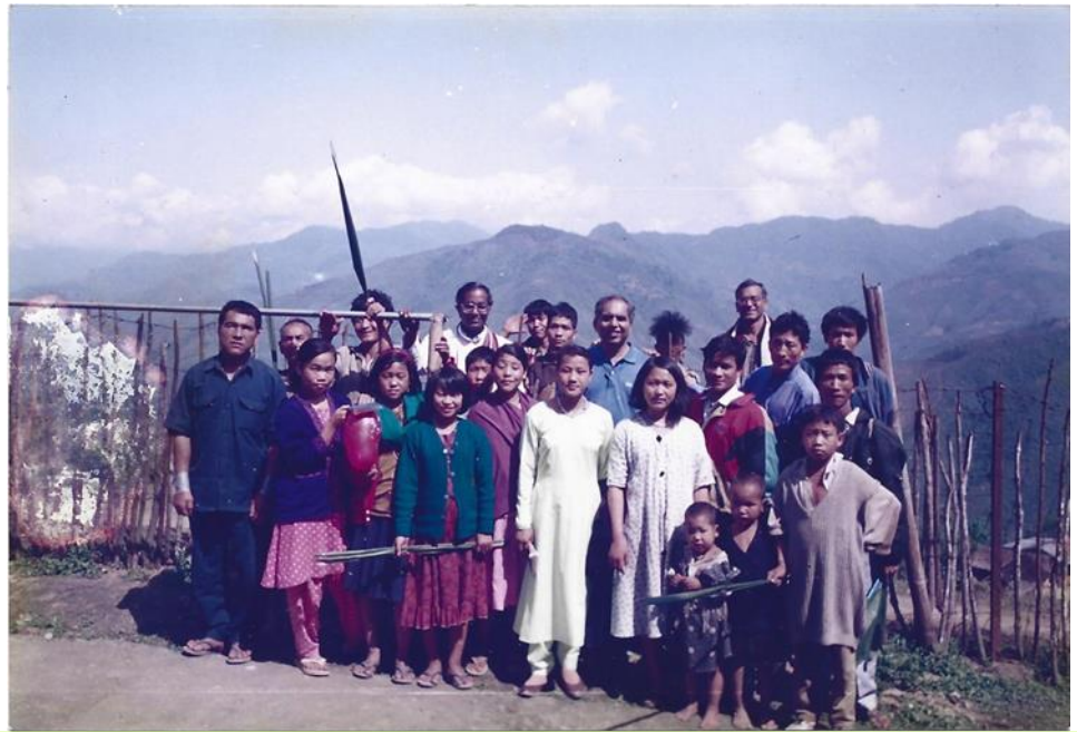
Brothers in Sangram on a feasibility visit with the children of Sangram